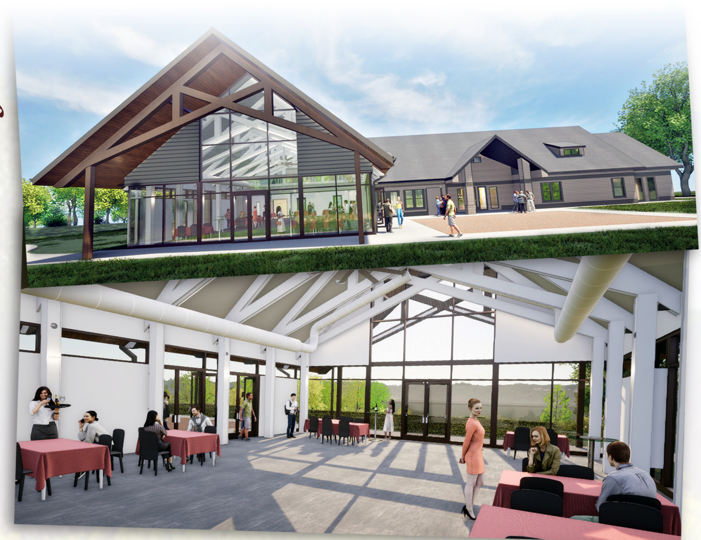
Renderings of Phase I of the Visitors Center expansion from the exterior and the interior.

As with many ambitious projects, we hit some unexpected bumps in the road with our Visitors Center expansion project. Good news: the project is officially beginning. Finally! Phase I will nearly double the capacity of our largest gathering space. It will open the room up to our incredible setting on the river with more windows and an outdoor patio. A new catering prep space, restrooms, and storage are also part of the project. This is the first major modification of the Visitors Center since it was completed in 1993. KNBA Associates are the architects. Miranda Construction is the general contractor.