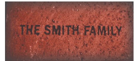
A sample commemorative brick.

Be a part of the exciting effort to keep "history on the move" at Riverside by purchasing a commemorative brick. Help us complete our capital expansion and open more of this beautiful historic property for public use.