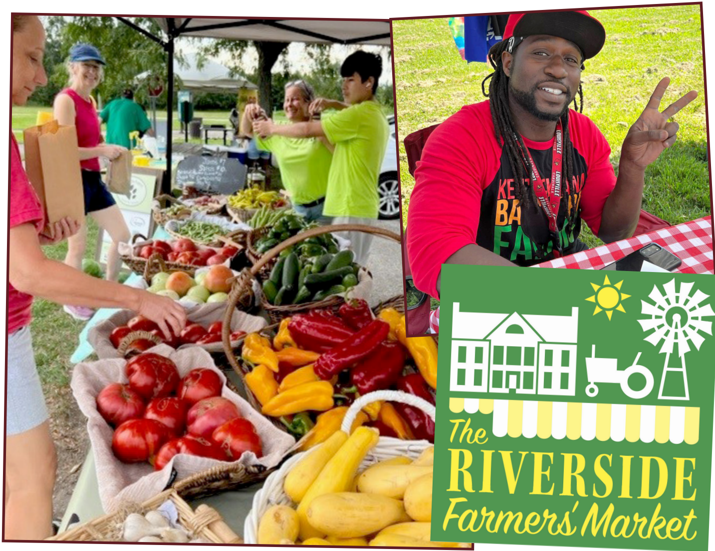
Riverside is happy to launch its 2nd year of the Riverside Farmers' Market. The market will be held weekly on Sundays from June 4 through September 24 from 10 am to 1 pm. The market features: fresh produce, farm-raised pork, fresh eggs, local honey, home-baked goods, preserves, salsas, hand-made soaps, fresh-popped kettle corn, and locally-made crafts. Buy local and eat fresh at our Kentucky Proud Market!