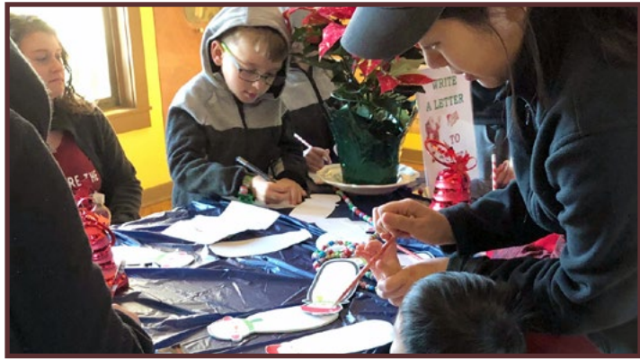
Top Left: Archaeology Day. Top Right: Two of the thousands (literally!) of children who attended this year’s Halloween Trick or Treat event. Estimated total attendance was over 3,000 people. Bottom Left: Children participate in a drum circle during the Ice Cream Social. Bottom Right: Writing letters to Santa at Old-Fashioned Holiday Festival