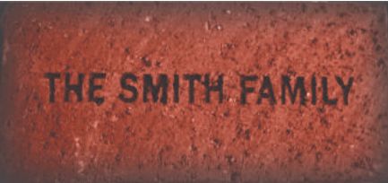
A sample commemorative brick.

Be a part of the exciting effort to keep "history on the move" at Riverside by purchasing a commemorative brick. Help us complete our capital expansion and open more of this beautiful historic property for public use.