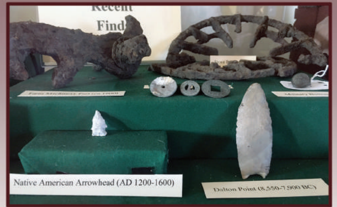
Recent archaeology finds at Riverside include a Native American arrowhead (left) dated AD 1200-1600 and a Dalton Point (right) dated 8550-7900 BC. Both are reminders that humans have been drawn to this place by the Ohio River's abundant resources for thousands of years before the Farnsley-Moremen House was built.