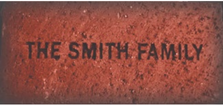
A sample commemorative brick.

Be a part of the exciting effort to keep “history on the move” at Riverside by purchasing a commemorative brick. Help us complete our capital expansion and open more of this beautiful historic property for public use.